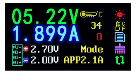
Quick Charge Recognition Interface